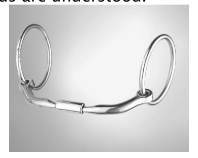
MB02, Comfort Snaffle, Level 1

A horse at Level One is at the beginning of its training, where basic balance and obedience is being asked for (eg. trot to walk, walk to halt, basic turning, etc.) and where few of the rider's body aids are understood.