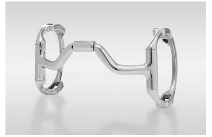
MB33, Low Medium Wide Ported Barrel, Level 3

The third level of training relates to "finished" horses from whom quite a high degree of collection and athleticism is expected. A Level Three horse will be relaxed and will work well off the rider's seat, leg and hand.