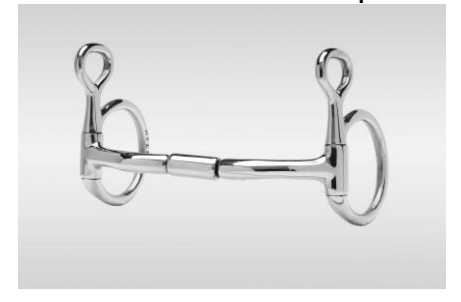
MB32 Mullen Barrel, Level 2

A horse at this stage has achieved a basic training, and is now progressing in a particular discipline, with a degree of balance and collection. He will be relaxed and flexed at the poll (ie on the vertical), and will be able to hold his outline when rein pressure is released. He will be stronger and able to sustain longer periods of work with better concentration and understanding. At this stage the rider wants to refine and define his aids for more precise work.